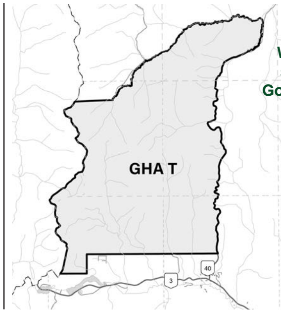
WMU 402 showing Goat Hunting Area T