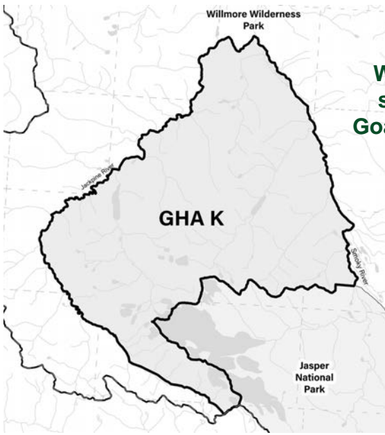
WMU 442 showing Goat Hunting Area K