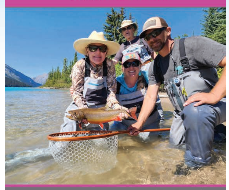
Brook Trout - Fortress Lake

SPEND THE DAY OR OVERNIGHT AT ONE OF THE PRISTINE LAKES BELOW - FROM $299 PER SEAT Cargo/Gear $3.00 a pound